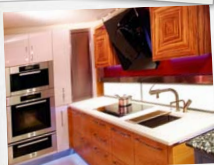
This Chiselwood kitchen features oak, Zambrano and White Parapan door fronts, with appliances from Miele's XL range and an Elica Om extractor