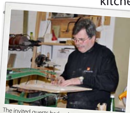
The invited guests had a chance to see some of Chiselwood's kitchen craftsmen at work