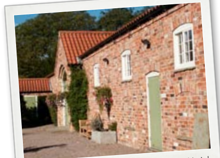
The event was hosted at the beautiful red brick workshop complex in Lincoln