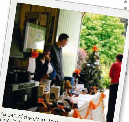
As part of the efforts to raise money for Lincolnshire St Barnabas Hospice, there was a great variety of raffle prizes on offer