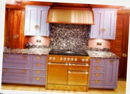
The Lincolnshire site hosts a selection of kitchen displays within the flagship Chiselwood showroom